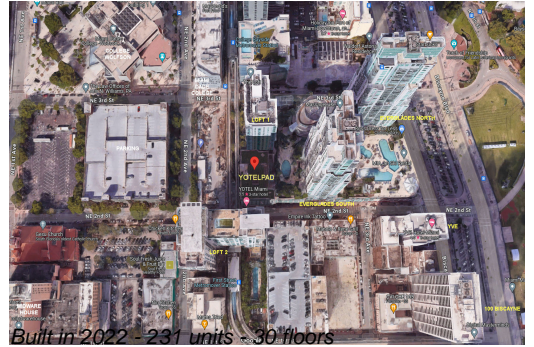
Built in 2022 - 231 units - 30 floors