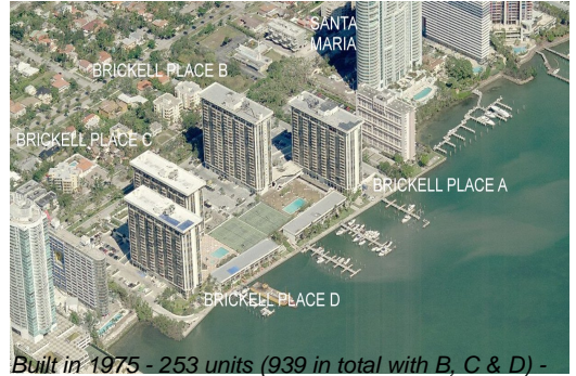
Built in 1975 - 253 units (939 in total with B, C & D) - 23 floors