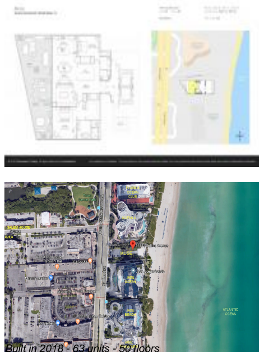
Built in 2018 - 63 units - 50 floors