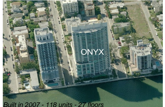
Built in 2007 - 118 units - 27 floors