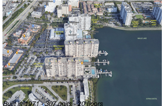
Built in 1971 - 307 units - 20 floors