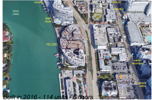
Built in 2016 - 114 units, 16 floors