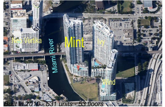
Built in 2010 - 531 units - 53 floors