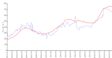
Oceania V vs Sunny Isles