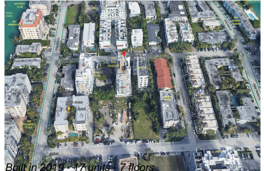
Built in 2019 - 17 units - 7 floors