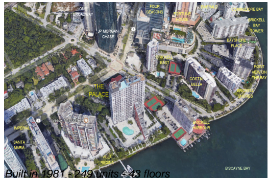
Built in 1981 - 249 units, 44 floors