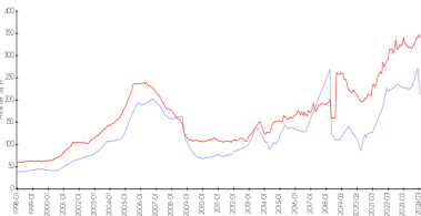
North Miami Beach vs Miami-Dade