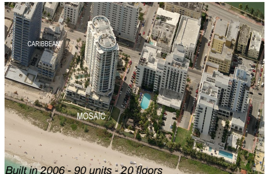
Built in 2006 - 90 units - 20 floors