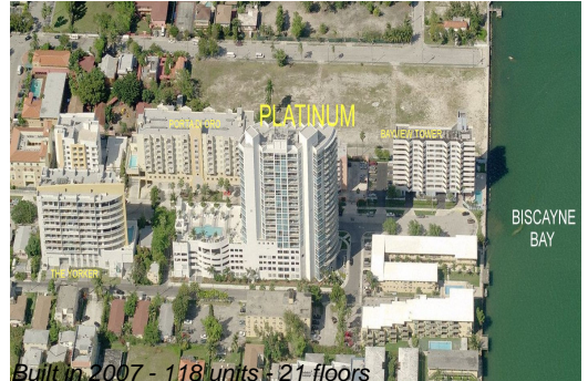
Built in 2007 - 118 units - 21 floors