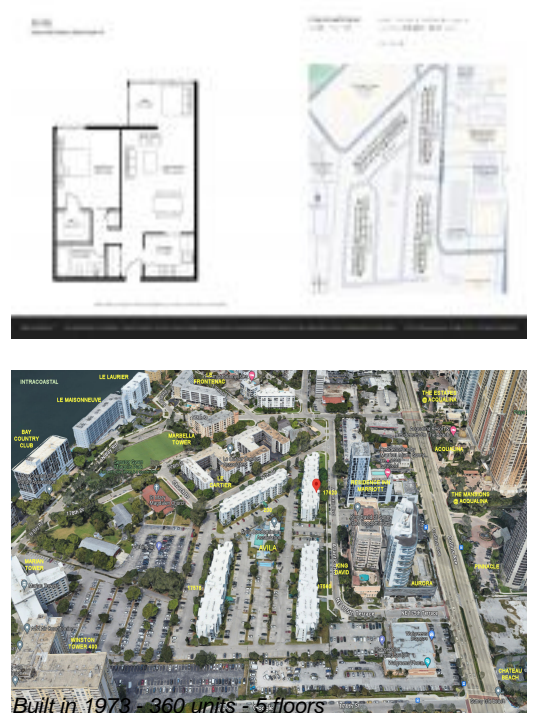
Built in 1973 - 360 units - 5 floors