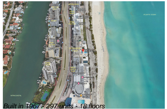
Built in 1967 - 297 units - 18 floors