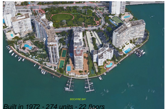
Built in 1972 - 274 units - 22 floors