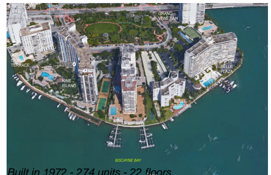
Built in 1972 - 274 units - 22 floors