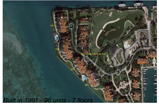
Built in 1991 - 96 units - 7 floors

MLS Number: A11501732 Status: Active Size: 3,790 Sq ft. Bedrooms: 4 Full Bathrooms: 4 Half Bathrooms: 1 Parking Spaces: Assigned Parking,Covered Parking,Golf Cart Parking View: List Price: $13,265,000 List PPSF: $3,500 Valuated Price: $8,574,000 Valuated PPSF: $2,262