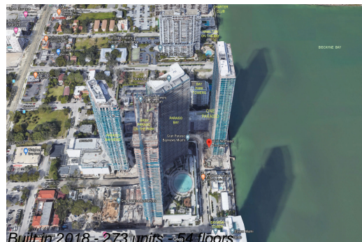
Built in 2018 - 273 units - 54 floors