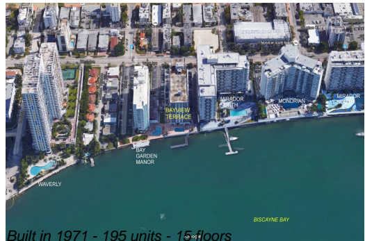
Built in 1971 - 195 units - 15 floors