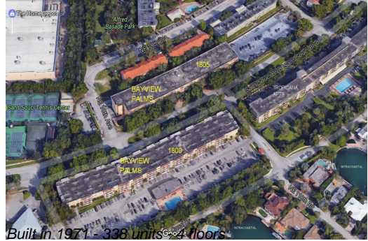
Built in 1971 - 338 units, 6 stories