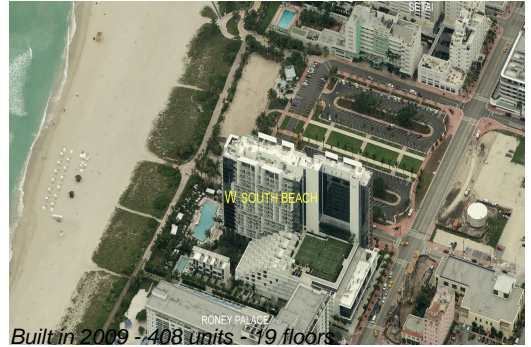
Built in 2009 - 408 units - 19 floors