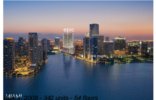
MIAMI 2008 - 342 units - 54 floors