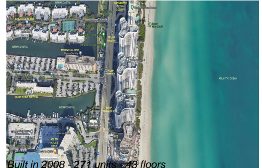
Built in 2008 - 271 units - 43 floors