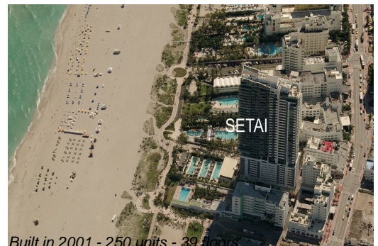
Built in 2001 - 250 units - 39 floors