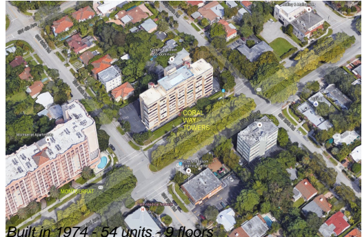
Built in 1974 - 54 units - 9 floors