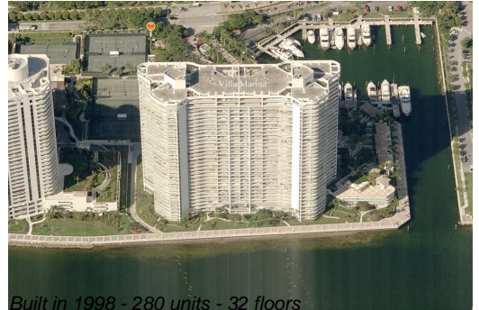
Built in 1998 - 280 units - 32 floors