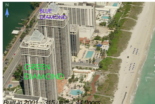
Built in 2001 - 315 units - 44 floors