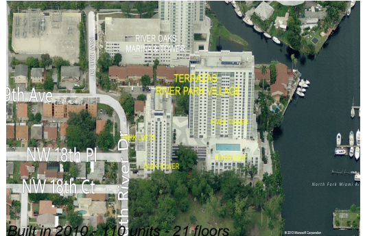
Built in 2010 - 110 units - 21 floors