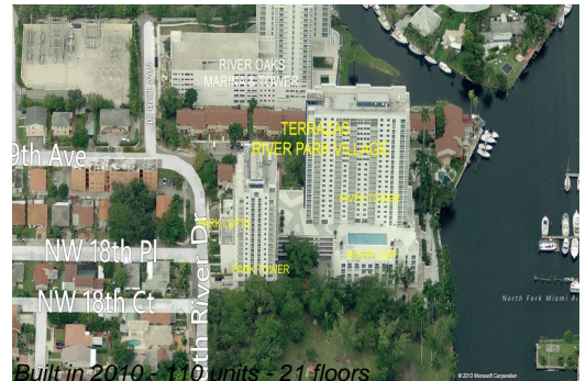
Built in 2010 - 110 units - 21 floors