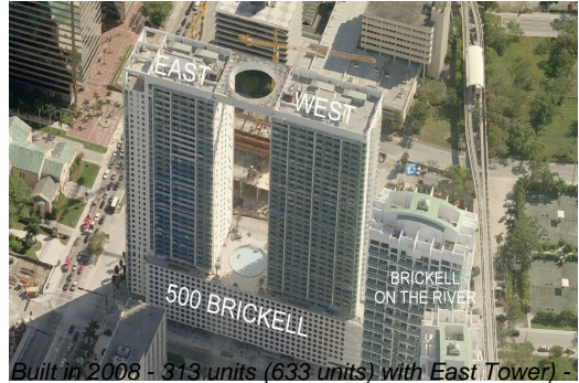
Built in 2008 - 3+3 units (633 units) with East Tower) - 43 floors