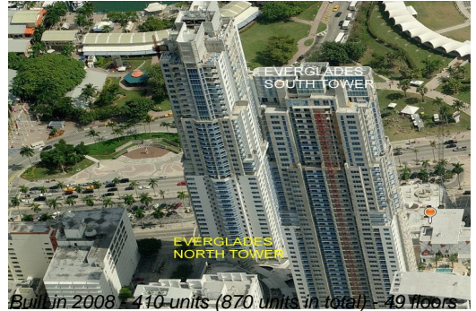
Built in 2008 - 410 units (870 units in total) - 49 floors