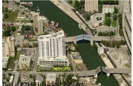
Built in 2004 - 199 units - 20 floors