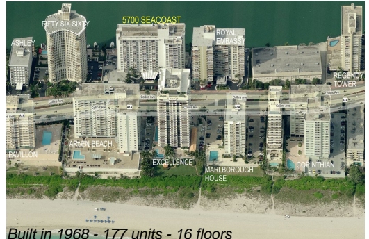
Built in 1968 - 177 units - 16 floors