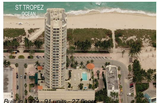
Built in 1999 - 91 units - 27 floors