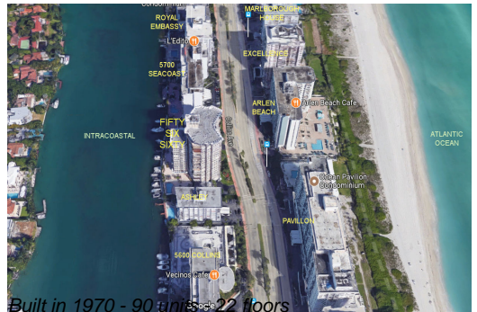
Built in 1970 - 90 units, 22 floors