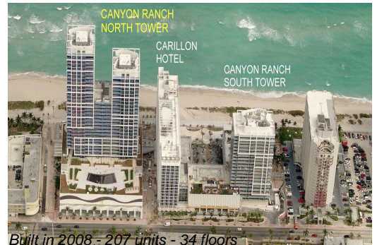
Built in 2008 - 207 units - 34 floors