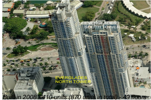
Built in 2008 - 410 units (870 units in total) - 49 floors