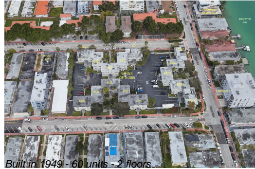
Built in 1949 - 60 units - 2 floors.