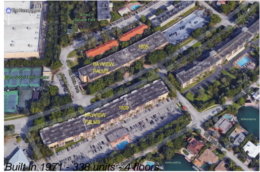
Built in 1971 - 338 units, 32nd floor