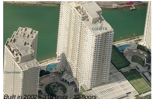
Built in 2002 - 319 units - 32 floors