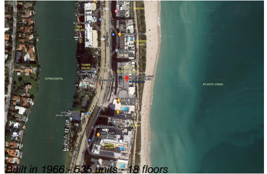
Built in 1966 - 535 units - 18 floors

The above valuated price is a baseline figure that does not take into account any specific renovation, upgrade, split, merge, or deterioration of the unit.