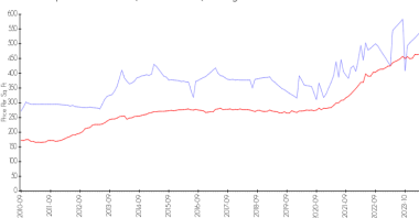
Eloquence on the Bay vs North Bay Village