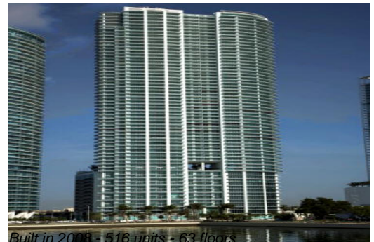
Built in 2009 - 516 units - 63 floors