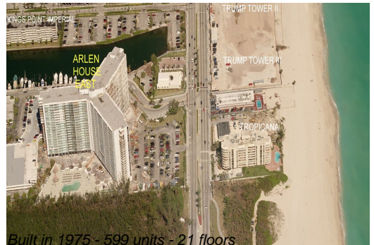
Built in 1975 - 599 units - 21 floors