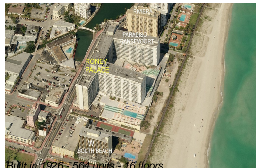
Built in 1926 - 564 units - 16 floors