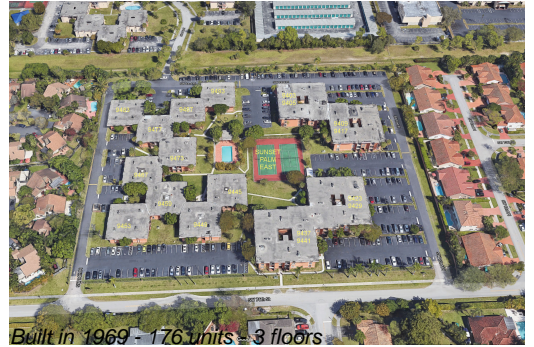
Built in 1969 - 176 units - 3 floors