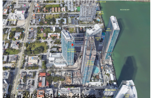
Built in 2018 - 384 units - 44 floors