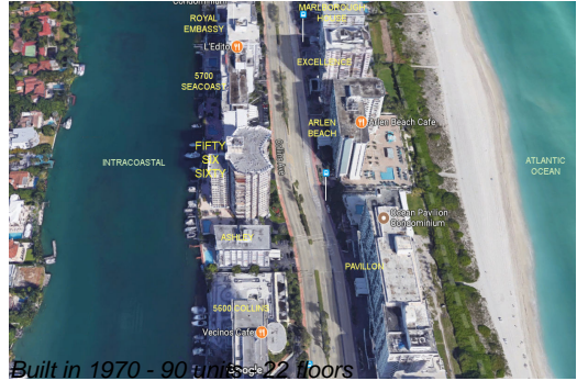
Built in 1970 - 90 units, 22 floors