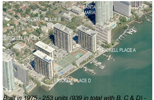
Built in 1975 - 253 units (939 in total with B, C & D) - 23 floors