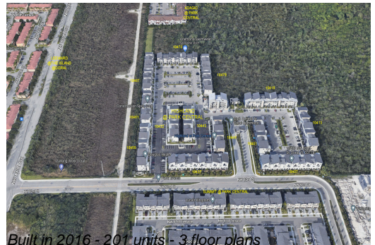
Built in 2016 - 201 units - 3 floor plans